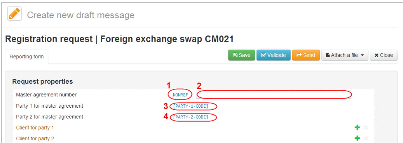
Figure 3 – filling out the Number of master agreement field

Clicking on the link opens a form, where the user can select a master agreement (Fig. 4).